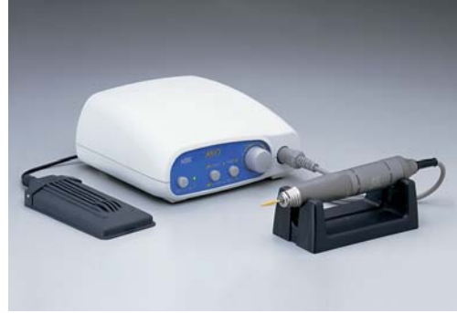
Standard Micromotor System