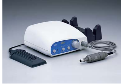
E-Type Micromotor System without Handpiece