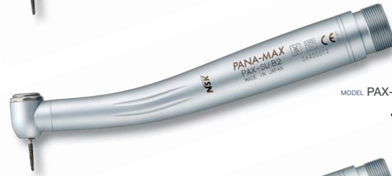
MODEL PAX-SU B2 ORDER CODE P562-001