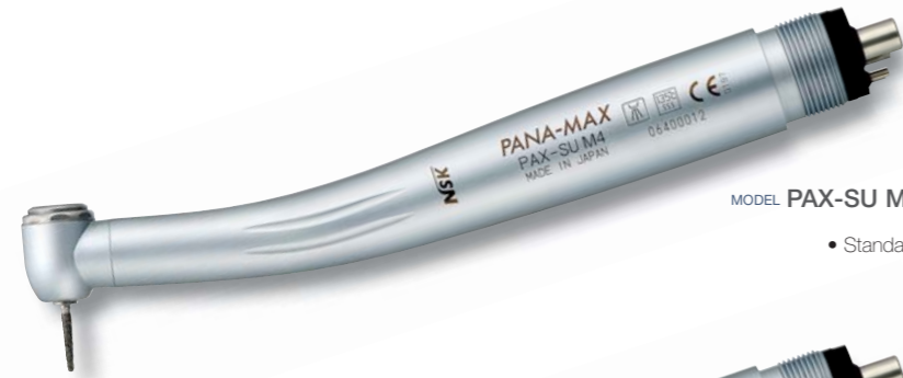
MODEL PAX-SU M4 ORDER CODE P560-001