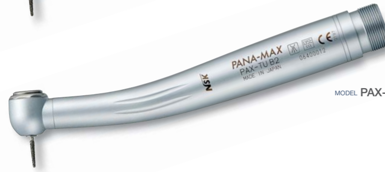
MODEL PAX-TU B2 ORDER CODE P563-001