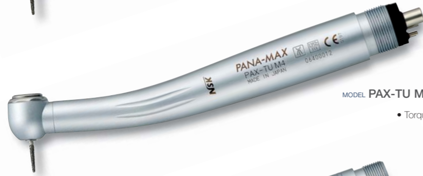
MODEL PAX-TU M4 ORDER CODE P561-001