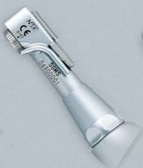
SGMS-ER20i With Depth Indicator