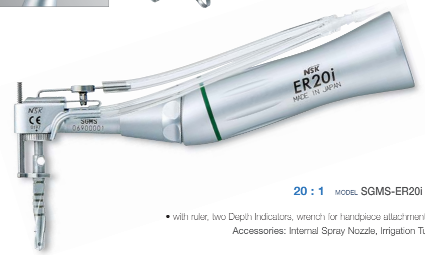
20 : 1 MODEL SGMS-ER20i ORDER CODE Y110-147

• with ruler, two Depth Indicators, wrench for handpiece attachment and E-Type spray nozzle Accessories: Internal Spray Nozzle, Irrigation Tube Clamp, Y-Connector