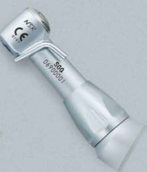
SGQ-ER20h Push Button