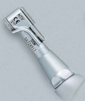
SGM-ER20i Latch Type Miniature Head