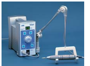
Suspension Handpiece Cradle (Option)

Optional handpiece cradle enables you to work while suspending the handpiece in the air. More space on the desk allows you more flexibility. Arm length is adjustable.